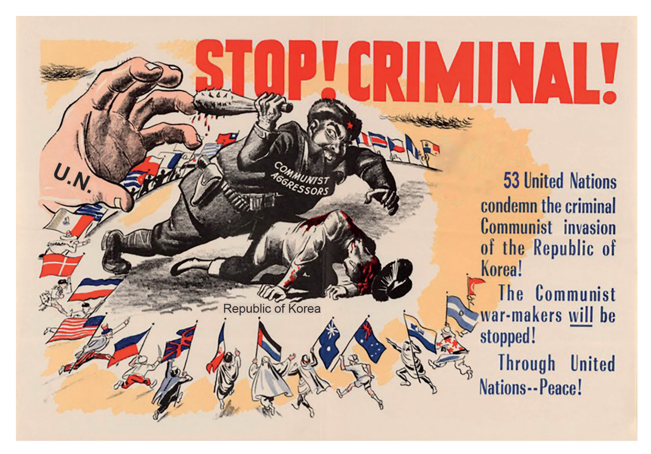
END OF SOURCES

A poster published in 1950 by the US Government after the UN agreement regarding Korea.