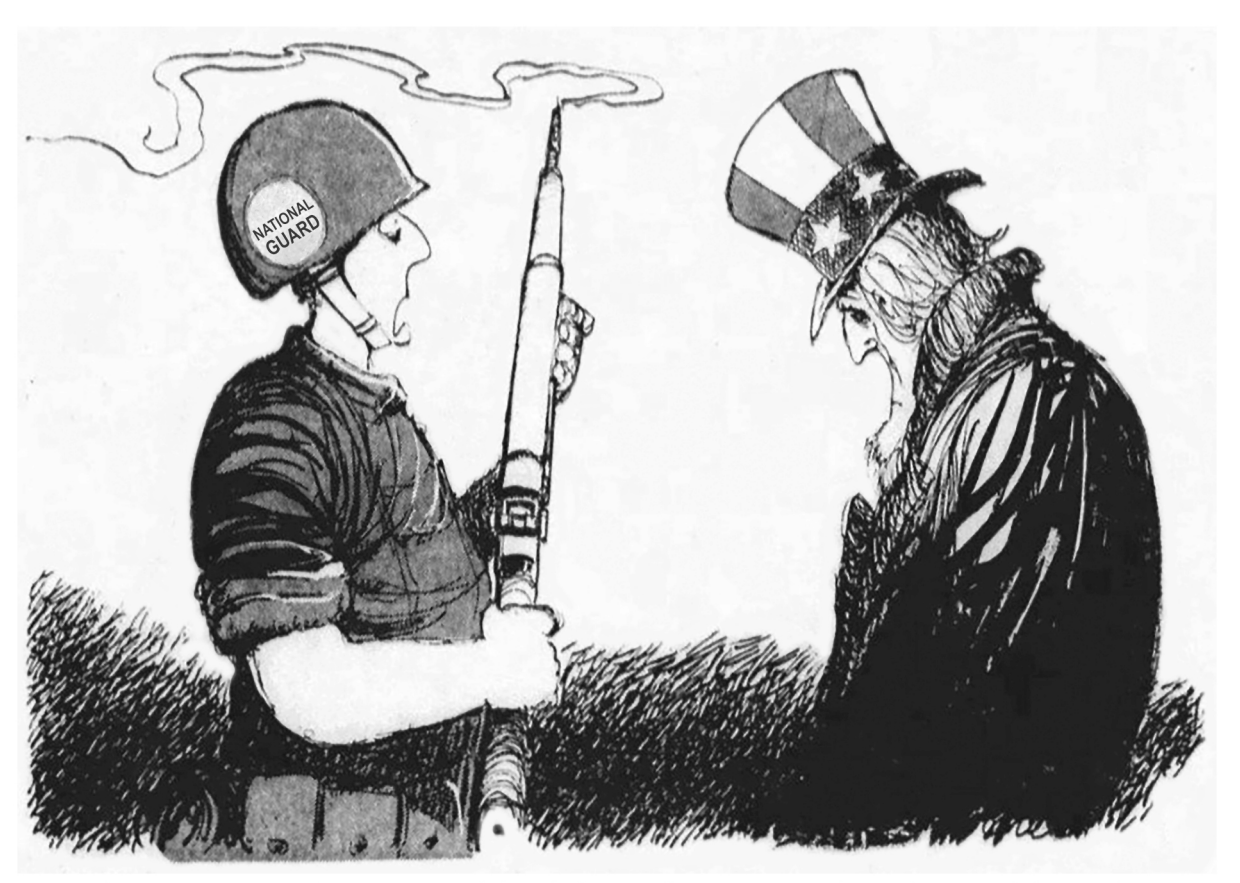
'They were coming at us with sticks and stones. What else could we do?'